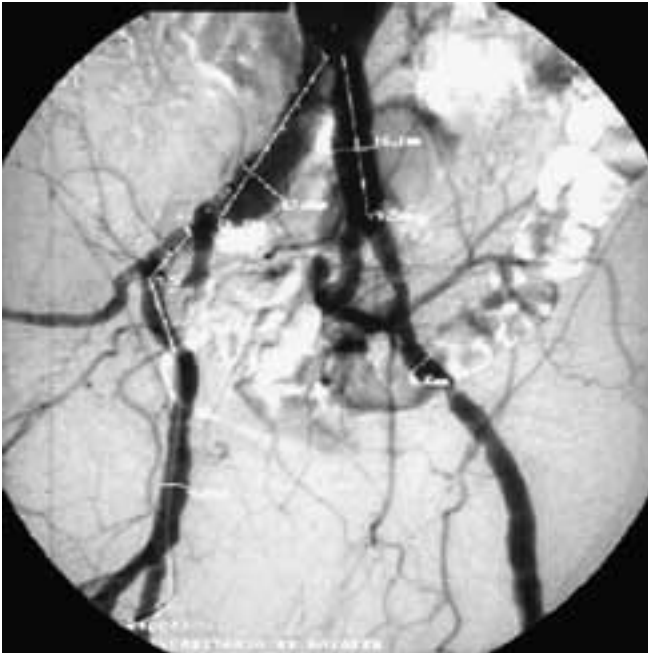
Figure 2. – Preoperative angiogram of case 1 showing tortuosity and stenotic disease of the iliac vessels.

and with a preoperative bilateral ankle/braquial <0.60 . Furthermore, our case 1 was associated with embolization of internal iliac artery and had aortouni-iliac grafts extended to the external iliac artery and, as speculate Carroccio et al. , 8 the sacrifice of the hypogastric outflow can contribute to the detrimental of graft limb patency.