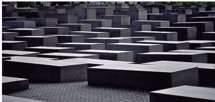
Memorial to the Murdered Jews of Europe Berlin, 2005, Eisenman Architects.