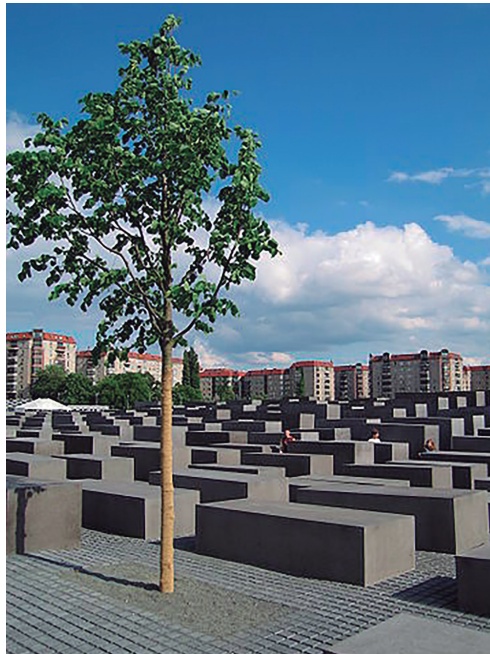
f1_Memorial to the Murdered Jews of Europe

Blocks thus come out of time via theories of temporization, which bounds the actual physical plane of any future interpretation. Thus the speed of time leaves only an essence of a trace that could only appear retroactively as a deferred future. Koselleck's historicity accredits the unstable actions of history to the nature of a living 'consciousness' -as if to say that history 'thinks' itself historically. "Coefficients of change and acceleration transform old fields of meaning and therefore, political and social experience as well" 8 . Concepts of history then are mapped over into the 'coefficient' of the image that would be to suggest that all images of architecture explain the elasticity of history in the present.