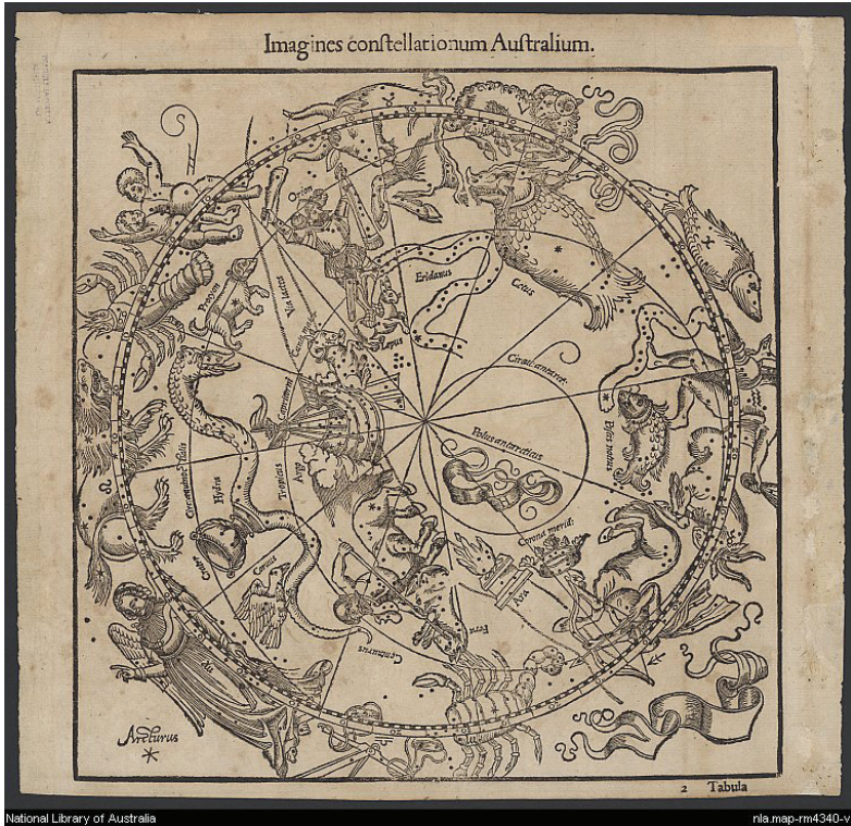
Image 2. Southern sky hemispherical celestial chart. First published in: Claudii Ptolemaei Pelusienis Alexandrini Omnia, quae extant, opera, Geographia excepta . Basileae, Apud Henricum Petrum, mense Martio, 1541, source < http://nla.gov.au/nla.map-rm4340 > [18/09/2015].