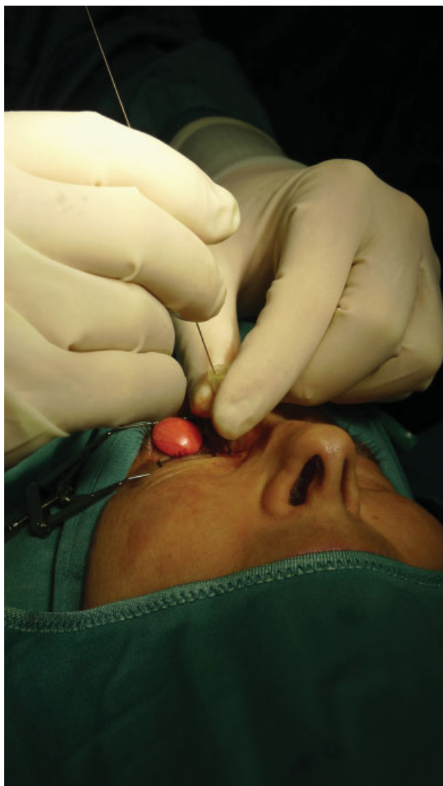
Fig. 1 Using the Seldinger technique, place the guidewire through and down the lumen of the needle. Apply gentle finger pressure on the guidewire to maintain position in the anterior ethmoid or in the nasal cavity while removing the needle.